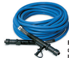
ProHeat liquid-cooled induction heating cable.

Improved working environment is created during welding. Welders are not exposed to open flame, explosive gases and hot elements associated with fuel gas heating and resistance heating.