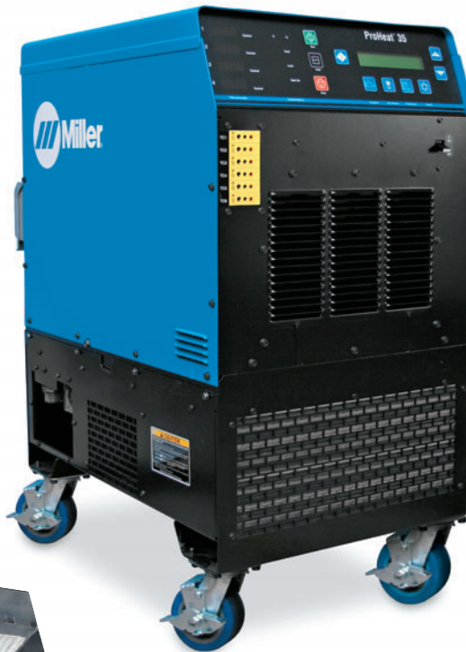
ProHeat 35 power source shown with heavy-duty induction cooler (951686) and optional running gear (195436).